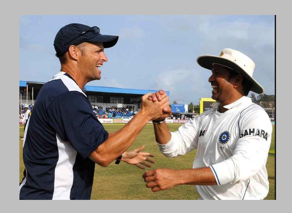
"The gift of leading others"