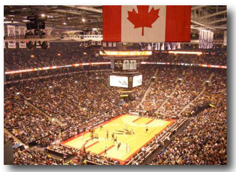
Air Canada Centre, Home of: The Toronto Maple Leafs (NHL) , The Toronto Raptors (NBA), & The Toronto Rock (NLL)

Toronto is a thriving centre for high performance sport, both amateur and professional. These professional sport organizations have carved out a notable place in Toronto's community. The city is home to Major League Baseball's Toronto Blue Jays, the National Basketball Association's Toronto Raptors, Major League Soccer's Toronto Football Club, the National Hockey League's Toronto Maple Leafs and the Canadian Football League's Toronto Argonauts. Toronto has also hosted a number of international sporting events including the 2007 FIFA U-20 World Cup and the Roger's Cup Tennis Open. Toronto is home to world-class sport. The facilities used by Toronto's professional sports teams are elite venues and are part of the Toronto 2015 Pan/Parapan American Games plan. These venues include: the Rogers Centre, the Air Canada Centre, the Rexall Centre, and the BMO Soccer Stadium.