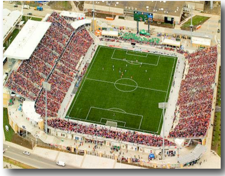
BMO Field, Home of: The Toronto Football Club (MLS)