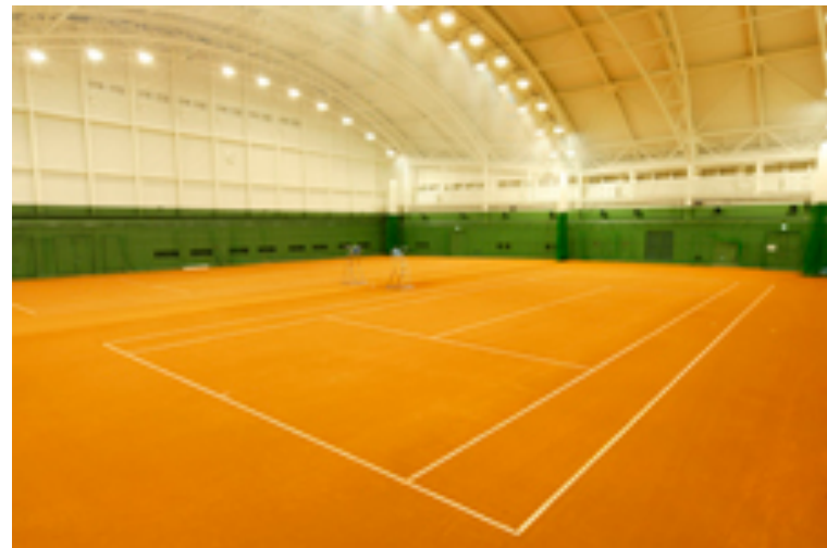
2 En-Tout-Cas Courts