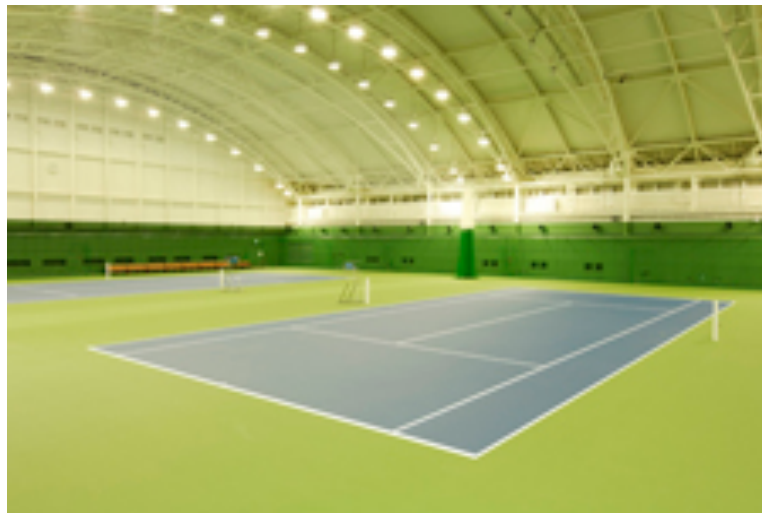
2 Hard Courts