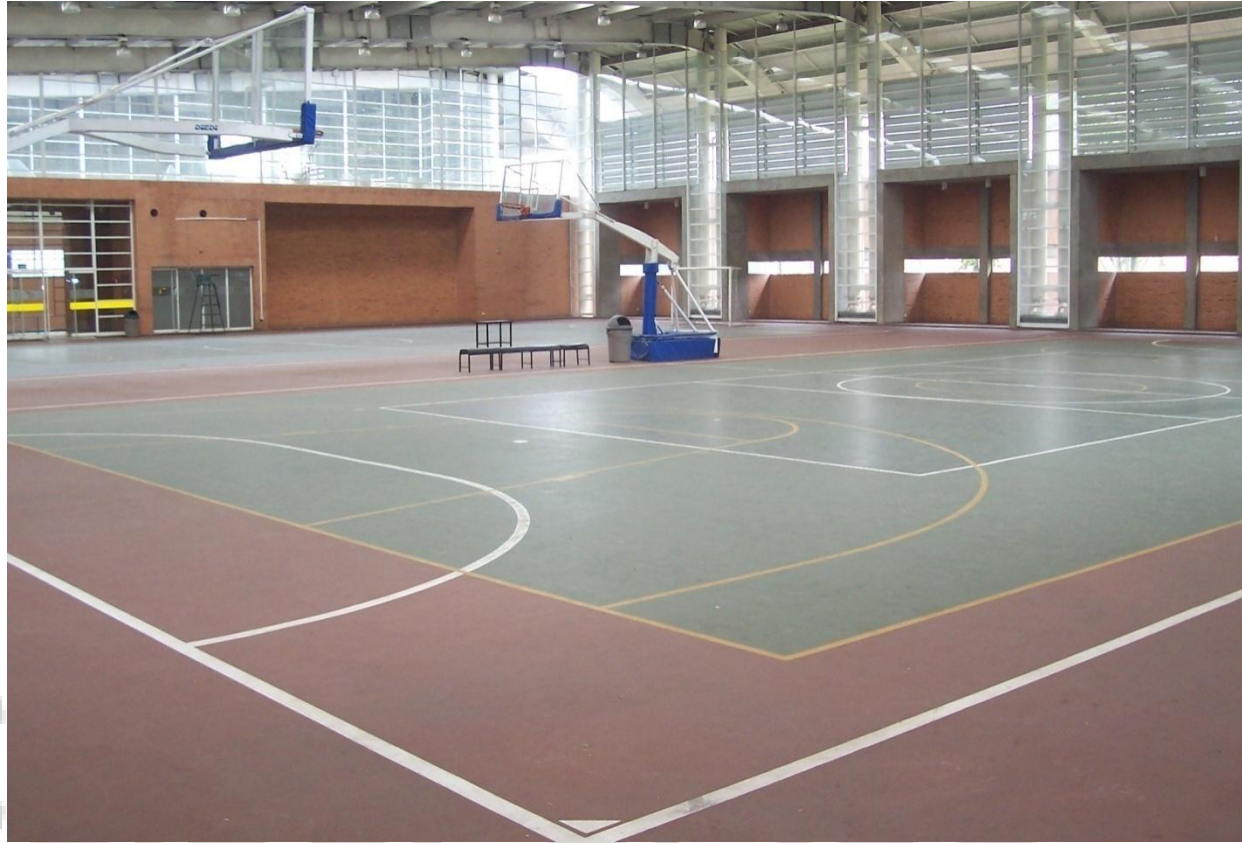
COLOSSEUM 3 Multiple area to practice basketball, volleyball and indoor soccer.