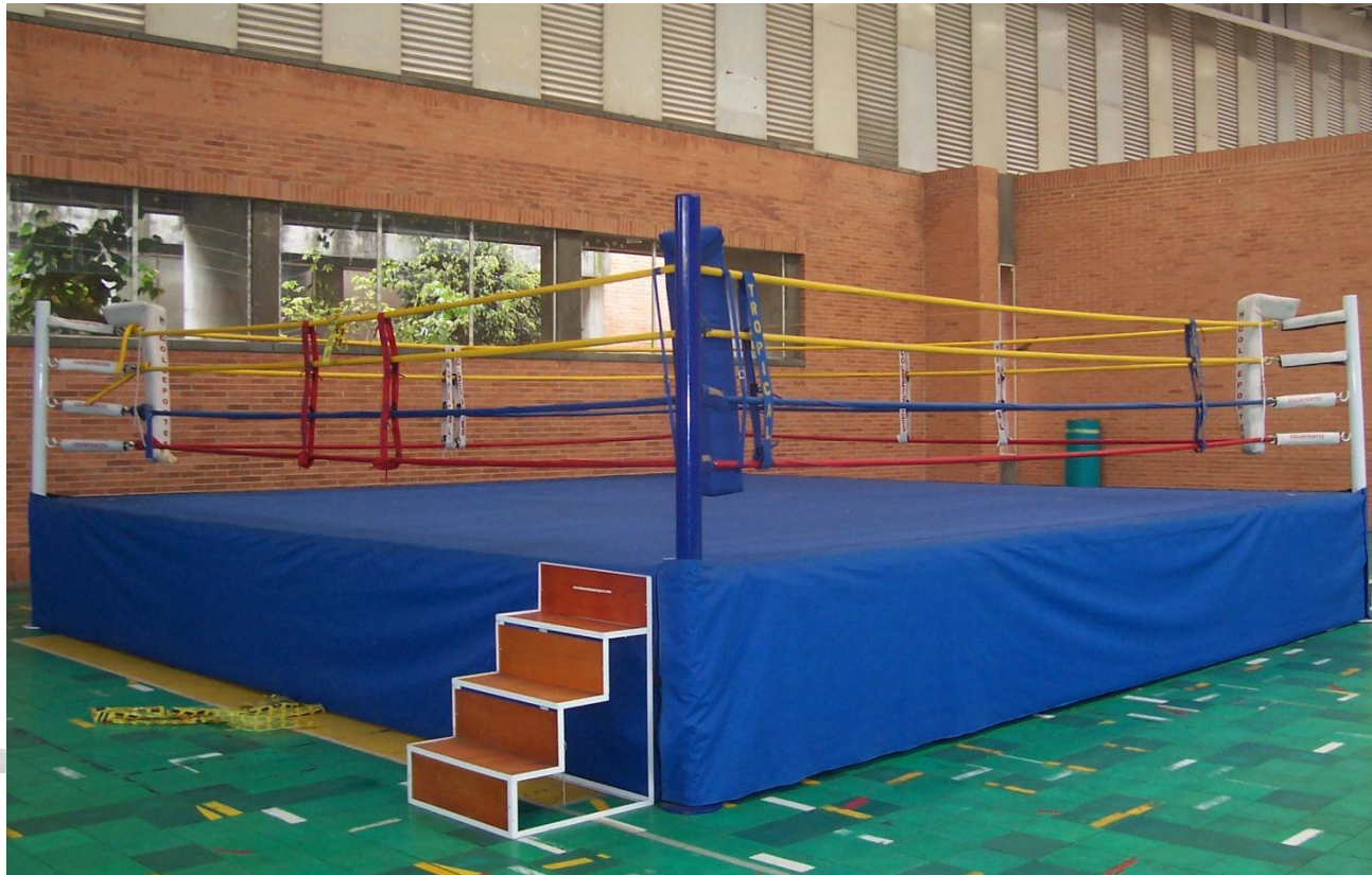
COLOSSEUM 2 With modular synthetic floor, stage with implementation for volleyball and boxing ring to warm up and practice area.