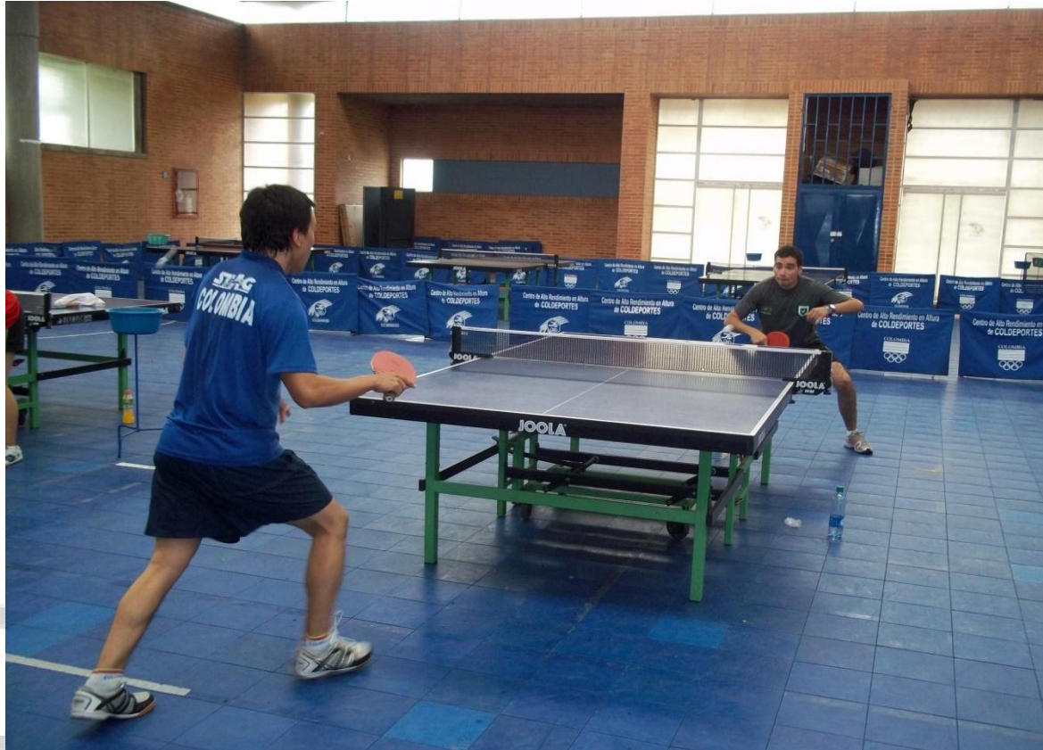
COLOSSEUM 1 With modular synthetic floor and 10 units for professional tennis table.